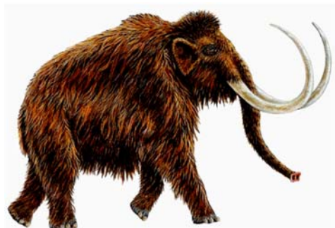
Fig. 1. A wooly mammoth, illustration

“Likewise, in the year 1807, according to their reckoning, they found in Siberia, in the northern part of the earth, under the terrible ice which is ever present there, a great elephant [the wooly mammoth] (Fig. 1, 2), three or four times the size of those found today, and whose skeleton now stands in the Zoological Museum in Petersburg. Moreover, inasmuch as elephants cannot live in the extreme cold which dominates that region, this carcass indicates that by the blow which the earth received and by which it was blasted and disordered, this elephant, which once lived in a warm climate that could support elephant life, was carried to its current location by the mighty waves ( i.e. , a cosmic upheaval), or that at one time the climate there was warm enough to support such animals. So too they have found in the depths of the highest mountains on earth, creatures of the sea which have fossilized and become stone.