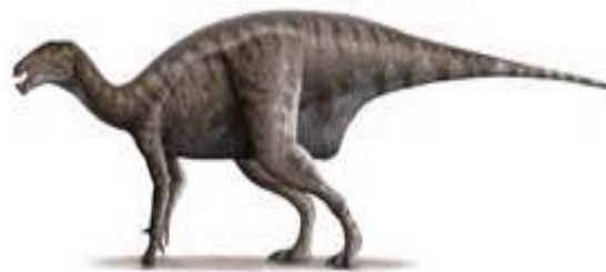
Fig 3. An iguanodon, illustration

“They have also found fossilized remnants of a creature they call iguanodon (Fig. 3), whose height was 15 feet and whose length was as much as 90 feet; from the character of its limbs, scientists have judged that it ate only grass. There is yet another species of animal called a megalosaurus (Fig. 4), which was only a little smaller than the iguanodon, but which was a hunter and carnivorous.